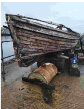
The Viking Just arrived at South Shields

This includes our taking ownership of an ex -Hartlepool Pilot boat called 'Viking' from Bridlington Sailing Coble Preservation Society (BSCPS). We thank them so much for their help in making this happen so professionally and without any problems at all. This potentially wonderful historic c1908 vessel is a double ender or 'mule', measuring just twenty two feet LOA. After restoration, she will sail again. Not quite a coble but a fast, light and very manoeuvrable workhorse (or mule).