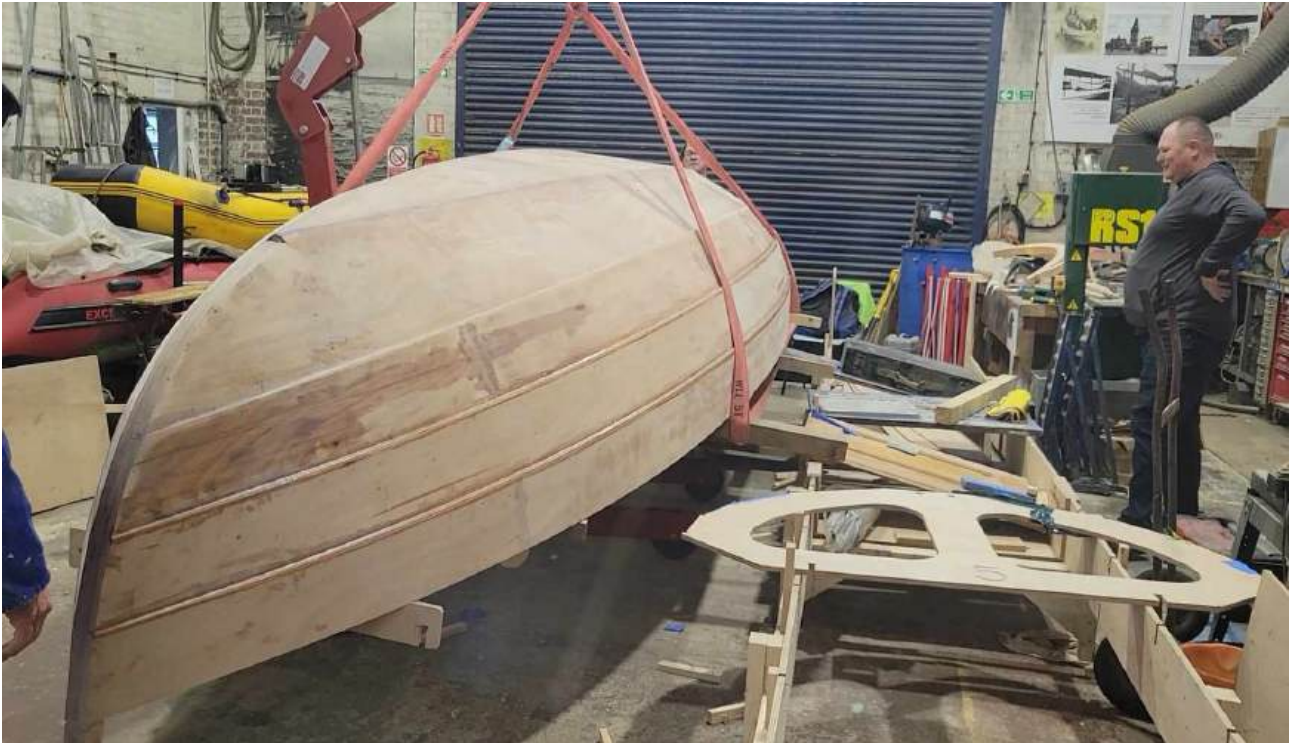
Above - Lifting the boat from its frame