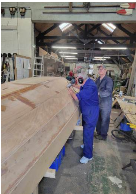
Below—Prep before turning over for the next stage of the build, exciting times.