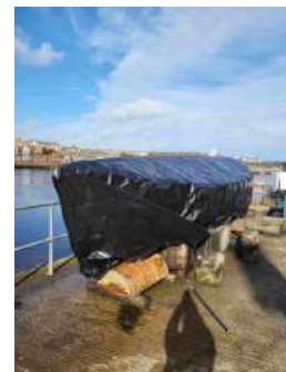
Getting ready for winter

We hope to produce a record of her time at Hartlepool, so as much help as possible regarding Viking's history will be very much appreciated.