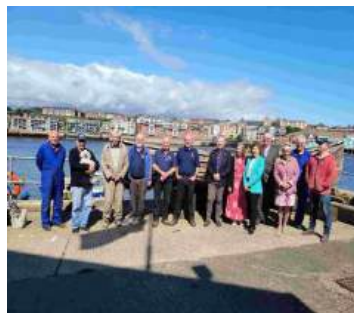
South Shields Mayoral visit